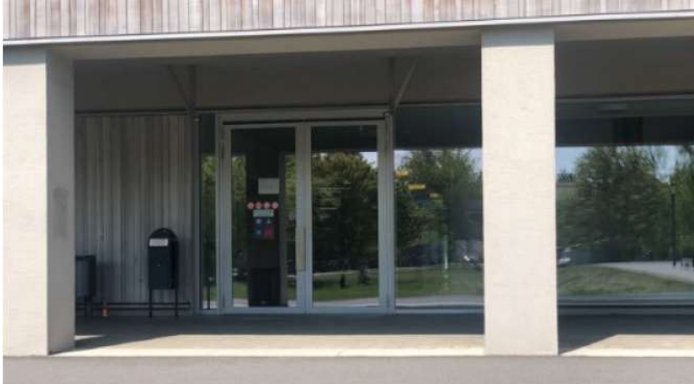
Image 4: Entrance to the building_ Image source: Freie Universität Berlin

Take the entrance marked in black (see image 2). You will need to walk about 100 meters along the building (see image 4). Then go through the entrance and walk to the middle of the building and take the middle stairs/elevator.